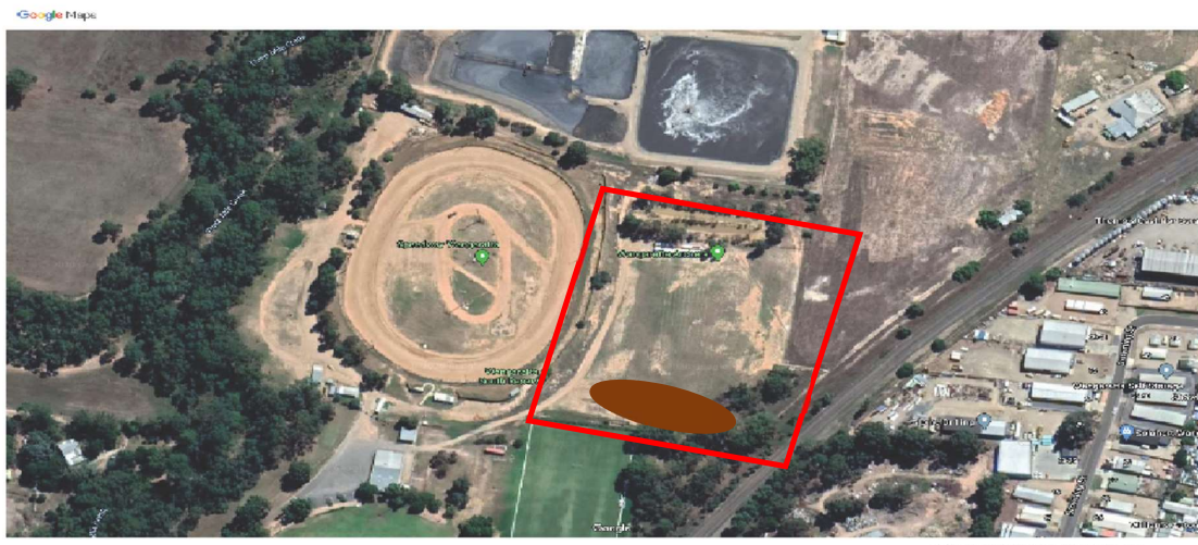
Figure 1 - Satellite view of WTA Outdoor Range

The red outline shows the location of the outdoor range. The only vehicular entrance is the graded gravel track running between the adjoining speedway and soccer pitch. There is a locked gate near the bottom left corner of the outline at the entry point of the range. The irregular brown shape at the bottom of the range is an earthen berm created as a buffer between the range and the adjoining soccer pitch.